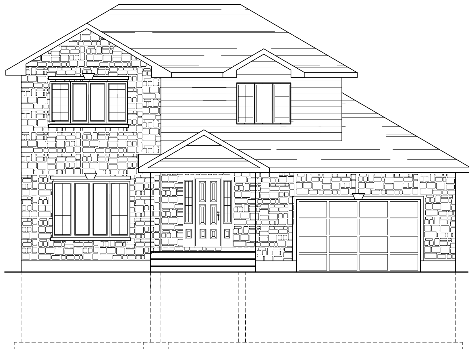
MODEL P2937 ELEVATION 1834 SQFT