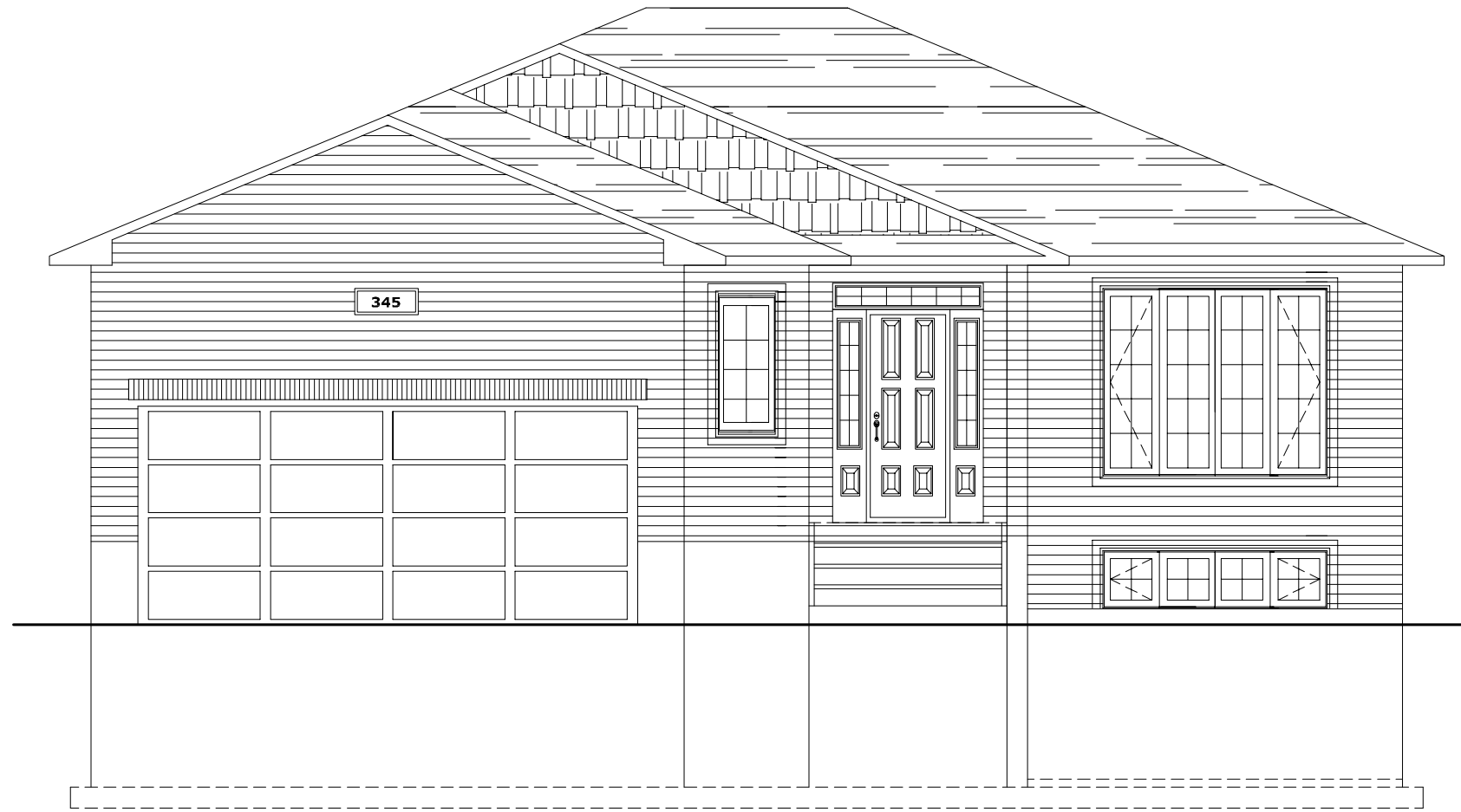
FRONT ELEVATION MODEL SAPPHIRE