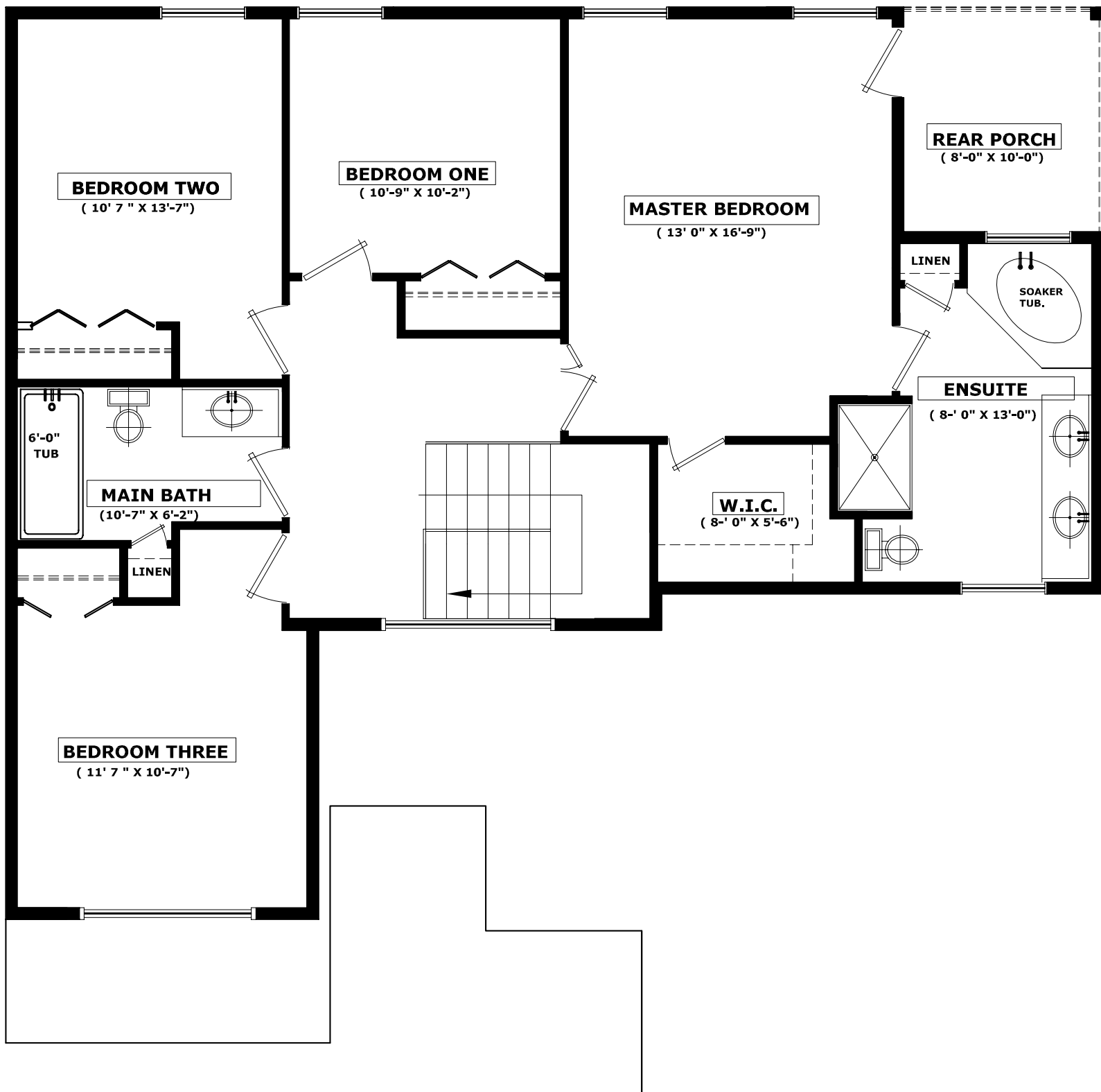
SECOND FLOOR PLAN MODEL PERIDOT 1160 SQFT.