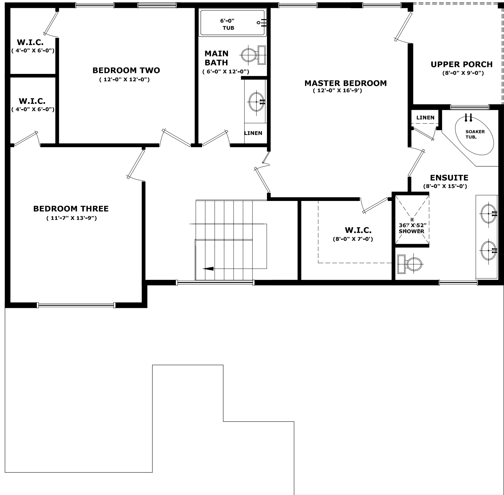
SECOND FLOOR PLAN MODEL PERIDOT 11 2300 SQFT