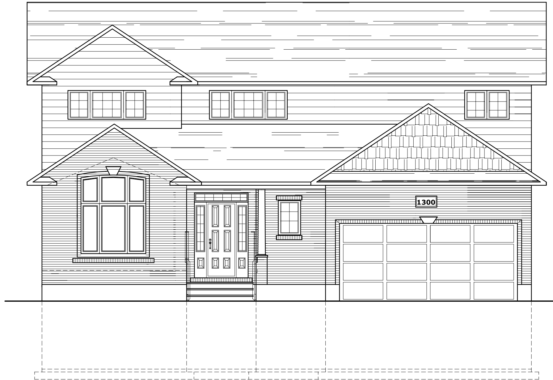
FRONT ELEVATION MODEL PERIDOT 11 2300 SQFT