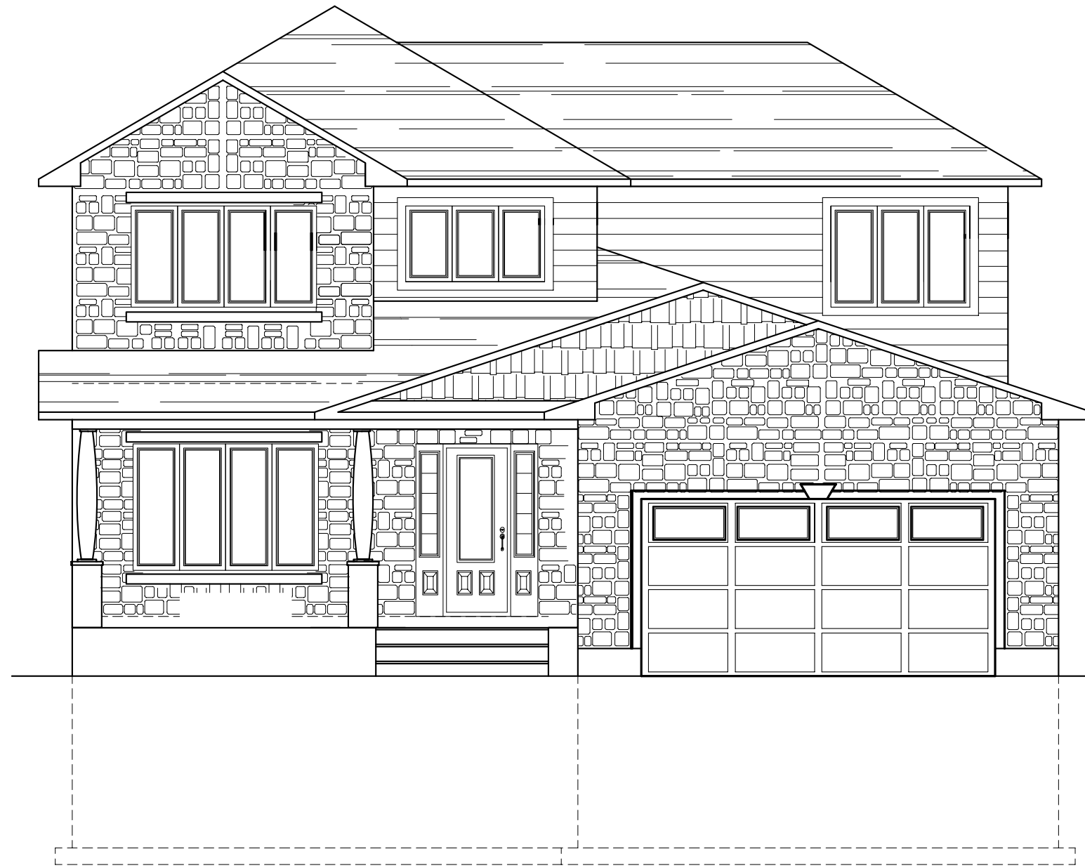
MODEL FRONT ELEVATION P2915 2198 SQFT