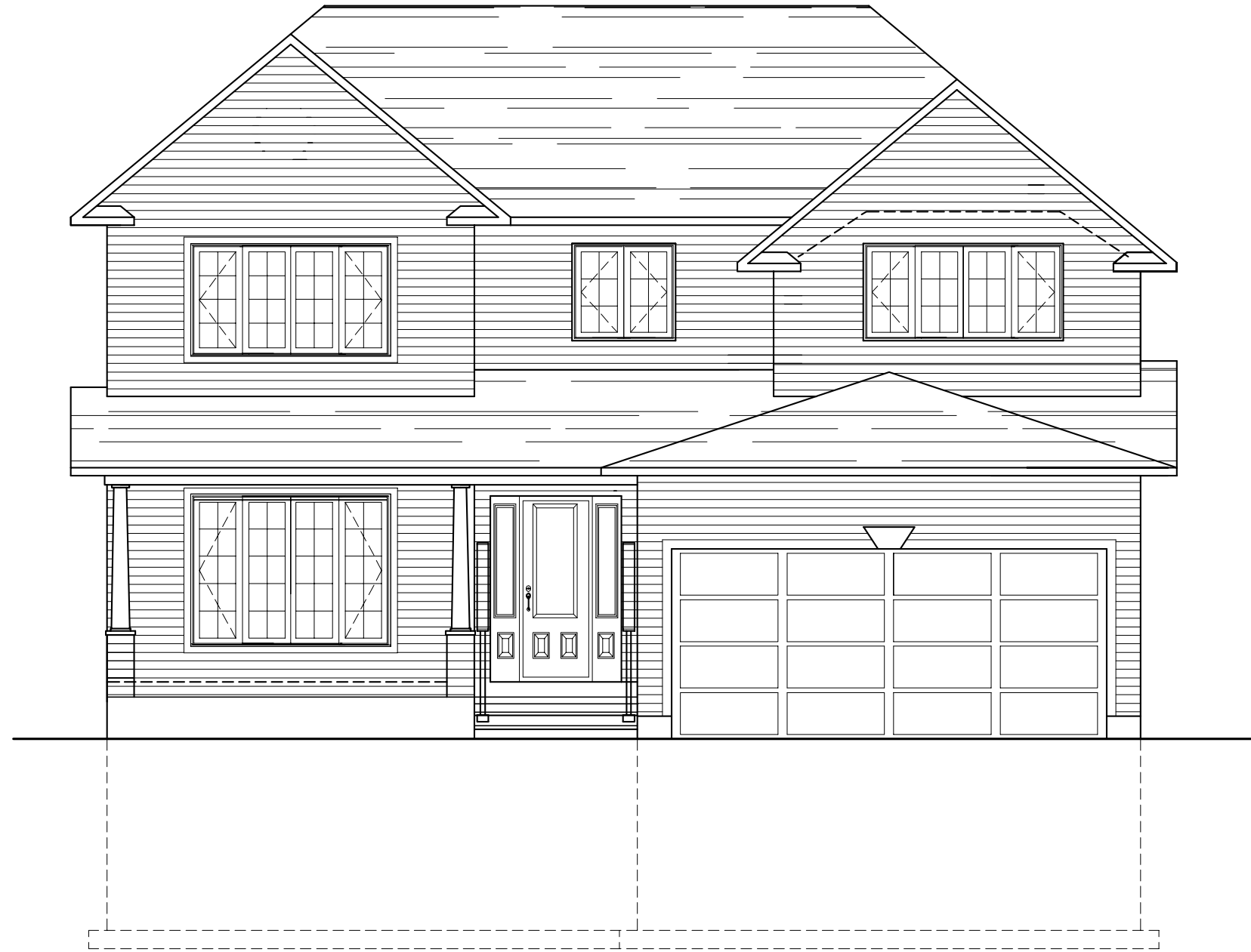
FRONT ELEVATION MODEL GRANITE

DECLARATION OF DESIGNER UNDER SECTION 2.17.4 OF O.B.C. 2006 MOUNTAIN DRAFTING FIRM BCIN # 28171 3020 Drew Drive South Mountain, Ontario